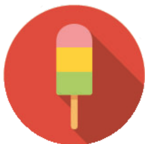
Modern Art Museum