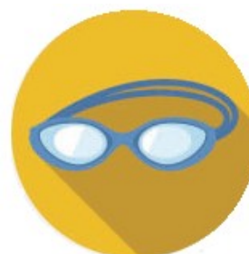
Camp Fort Worth