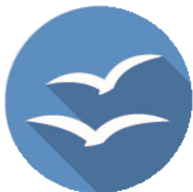
TCC College for Kids