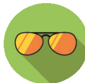
The First Tee of Fort Worth