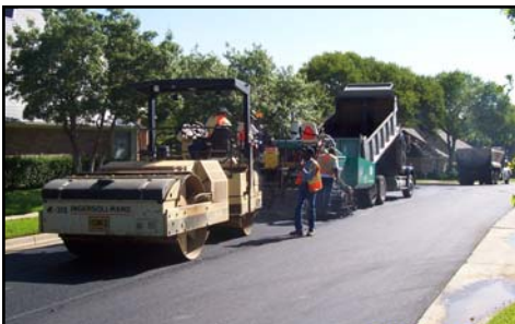
Precinct 3 crew placing asphalt on Plantation Road in Colleyville with the aid of the Texas heat.