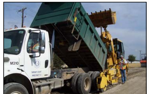
Placing flex base on Wagley Robertson Road in Fort Worth

dirt. Since most of our roads carry a lot of truck traffic, we add several inches of rock to the road base for stability, followed by cement for a solid base under the new asphalt layer to provide a smooth riding surface.