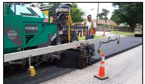
Precinct 3 crew placing asphalt on Brown Trail in Bedford

Right-of-way mowing will continue throughout the summer in unincorporated areas.