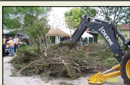
Precinct 3 Maintenance crew working with the City of Hurst and limb cleanup on Elm Street caused by April 10th storm.

T he thunder storm and high winds on April 10, 2008 gave Precinct Three the opportunity to step in and assist our cities and constituents in Hurst, Bedford, Watauga and Richland Hills with debris removal. Our Maintenance Center provided heavy equipment, trucks, chain saws, and personnel to help with the cleanup and removal of the damaged and uprooted trees.