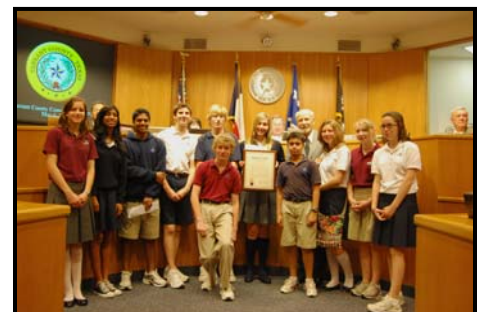
Westlake Academy was recognized by Commissioners Court for winning a total of 47 state scholastic journalistic awards at the UIL competition held in Austin in April for their student newspaper, "The Black Cow" named in honor of the cows grazing on neighboring ranchlands.