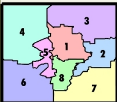
Tarrant County Justice of the Peace Precincts map.

Did you know we have eight Justice of the Peace and Constable Precincts serving Tarrant County? All serve their own designated area as indicated on the map below. For instance, the Justice of the Peace and Constable for Precinct One and Three serve a portion of the cities located in Northeast Tarrant County.