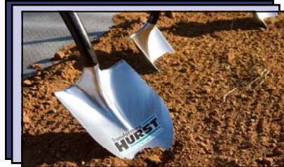
Groundbreaking for Hurst's New Fire Station #2 on W. Pipeline Rd

On Jan. 29 city and public officials broke ground on Heritage Village, one of three phases of the transforming initiative. Located on West Pipeline, this development will help revitalize an aging area of the city. Heritage Village is anchored by a new Senior Center and Fire Station and