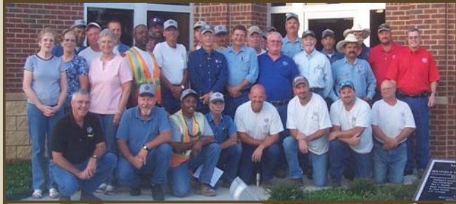
Precinct 3 Maintenance Center staff pose for a picture with Commissioner Fickes following a quarterly gathering before the start of their day.

The Precinct Three Maintenance Facility has had a busy year. In a cooperative effort with the cities of Fort Worth, Haltom City, Richland Hills, and the Fort Worth Transportation Authority (The T), we re-constructed a portion of Midway Road south of Highway 121 to provide clearance under The T railroad bridge. We