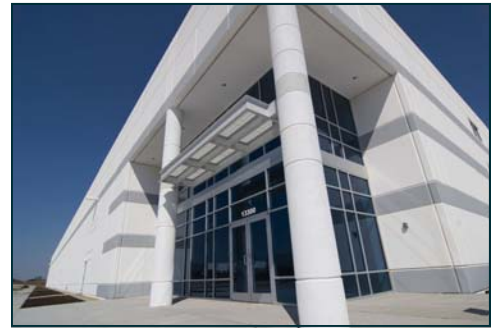
New speculative industrial building at AllianceTexas