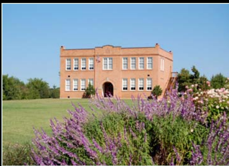
The Old Bedford School