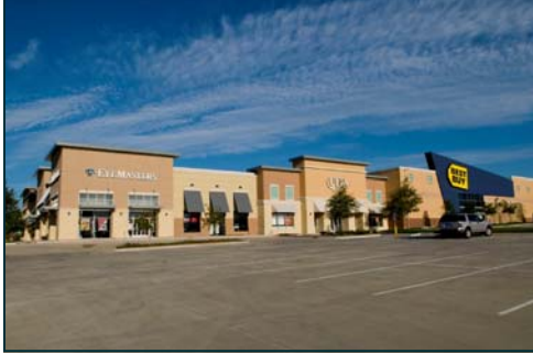
New retail shopping center in Alliance Town Center.