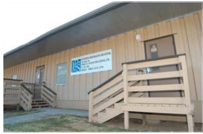
HEB ISD Child Health Care Center located at 1100 Raider Drive in Euless

A difficult reality many parents will face this flu season is choosing between taking their child to the doctor and taking time off work. For some an unscheduled absence from the job can mean hours unpaid. Transportation in this area can be challenging and finding quality health care isn't easy in every neighborhood. However, each year thousands of school children walk out of a classroom and into an exam room thanks to the School-Based