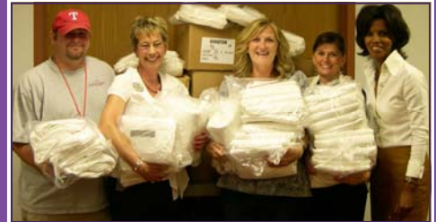
The Mid-Cities Supporters - SOS Group (pictured) makes a laundry donation to SafeHaven.

For immediate assistance regarding domestic violence, please contact the 24 hour toll free crisis hotline at 1-877-701-SAFE (7233) .