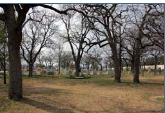
Dido Texas Cemetery Eagle Mountain Lake, north of Peden Road.