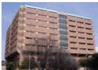
Tim Curry Criminal Justice Center 401 W Belknap Street Fort Worth, TX 76196