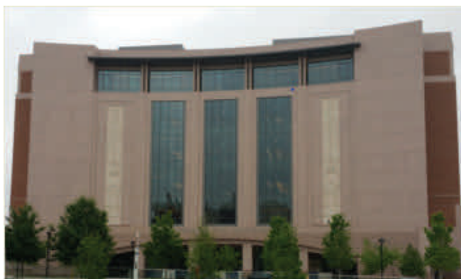
Tom Vandergriff Civil Courts Building 100 N. Calhoun Street Fort Worth, Texas 76196

It's an exciting time for all of us as we are nearing the date when we can move our District Clerk Civil section along with the Civil judges out of the justice center to the new building shown above.