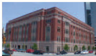
Family Law Center 200 E Weatherford Street Fort Worth, TX 76196