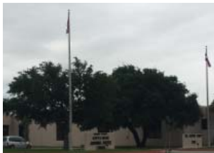
Scott D. Moore Juvenile Justice Center 2701 Kimbo Road