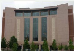
Tom Vandergriff Civil Courts Building 100 N Calhoun Street