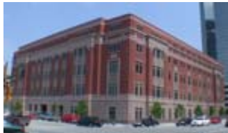
Family Law Center 200 E Weatherford Street Fort Worth, TX 76196