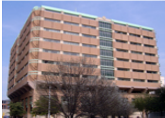
Tim Curry Criminal Justice Center 401 W Belknap Street Fort Worth, TX 76196