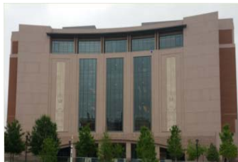
Tom Vandergriff Civil Courts Building 100 N Calhoun Street Fort Worth, TX 76196