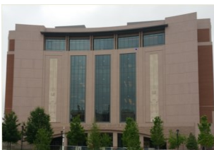
Tom Vandergriff Civil Courts Building 100 N Calhoun Street