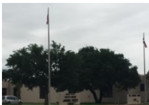
Scott D. Moore Juvenile Justice Center 2701 Kimbo Road