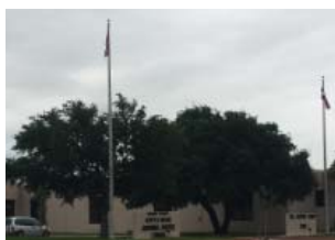
Scott D. Moore Juvenile Justice Center 2701 Kimbo Road