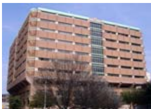
Tim Curry Criminal Justice Center 401 W Belknap Street