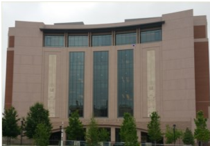
Tom Vandergriff Civil Courts Building 100 N Calhoun Street