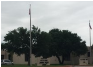
Scott D. Moore Juvenile Justice Center 2701 Kimbo Road