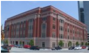
Family Law Center 200 E Weatherford Street