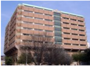
Tim Curry Criminal Justice Center 401 W Belknap Street