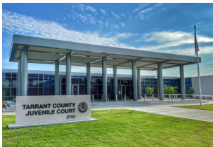
Scott D. Moore Juvenile Justice Center 2701 Kimbo Road, East Building