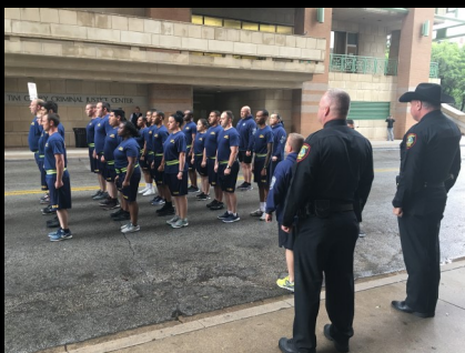
Jail Academy Class Bravo's Victory Run