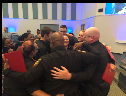
Celebration – 5 Detention Officers recently graduated from the Navarro Police Academy