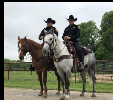
Our newest Patrol recruits: Goose and Preacher