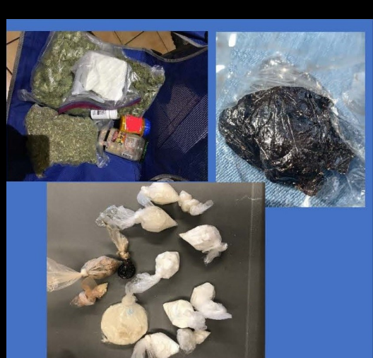
Marijuana, cocaine, ecstasy, oxycodone, and black tar heroin

Recently CNET personnel completed training for the innovative crime analysis software, Penlink. This software will assist in researching and analyzing intelligence leads to further support criminal cases. Penlink's user friendly interface implements investigative support by utilizing data to develop complex crime analysis and crime mapping, making it easier to sort and view data. Its capabilities include, but are not limited to, autoloading subpoenaed phone records, internet communications, emails, instant messaging, social media, and presenting them in a visually appealing format to give clarity to complex data. CNET is excited that this valuable tool will be utilized within the next couple of months.