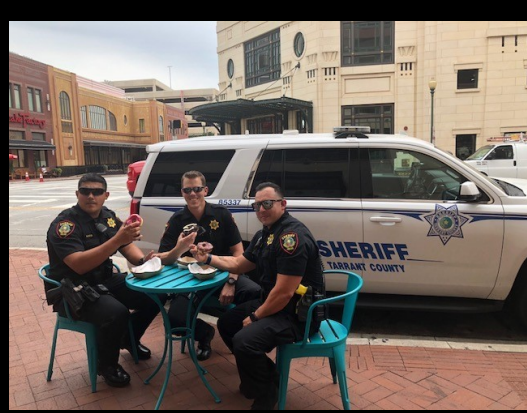
Warrant deputies on National Donut Day

We have made multiple personnel internal changes in 2019 due to retirements and promotions. We currently have personnel in field training and they are all doing outstanding. We are re-aligning some of our office personnel to better serve our unit and the citizens of Tarrant County. In the Warrants Division as a whole, we routinely assist others and we love what we do.